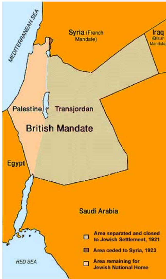
Great Britain's Division of the Mandated Area, 1921-1923

Source: Website of the Israel Ministry of Foreign Affairs