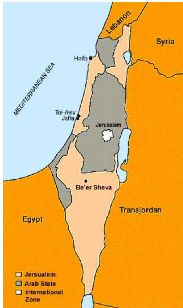
The Partition Plan, 1947 U.N. General Assembly Resolution 181

Following the British relinquishment of the Mandate in 1948, Israel declared its independence in accordance with the Partition resolution.