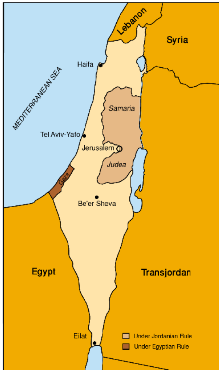
Armistice Lines, 1949